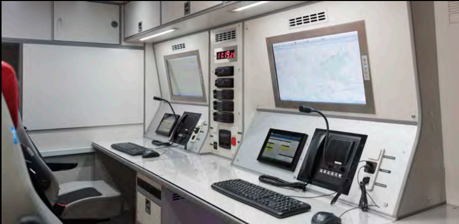
Ergonomic and networked workplaces with LARDIS® touchscreens plus conventional phone stations. Two PCs with operation support software and internet access through LTE.