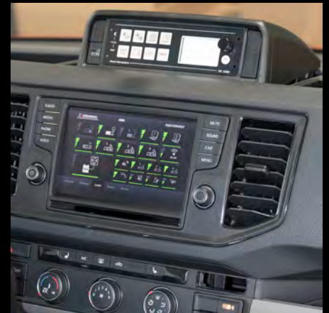
Operation and monitoring of the electrical system through the in-dash touchscreen.