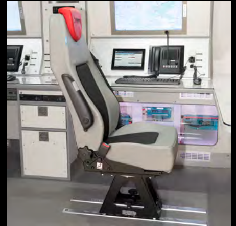
Seats with multiple adjustment options and M1 mark for use during normal driving