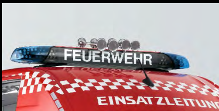
Hansch DBS 4000 incl. additional flashers, area lighting and Martin-Horn system