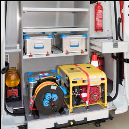
Rear shelving with heavy duty slide out, standard boxes, flashing lights, pylons etc.