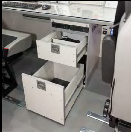
More storage between the two workplaces