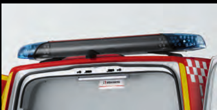
Hansch DBS 4000 incl. turn signals, rear flashers and area lighting